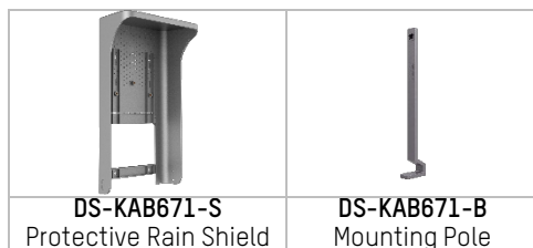
DS-KAB671-S Protective Rain Shield